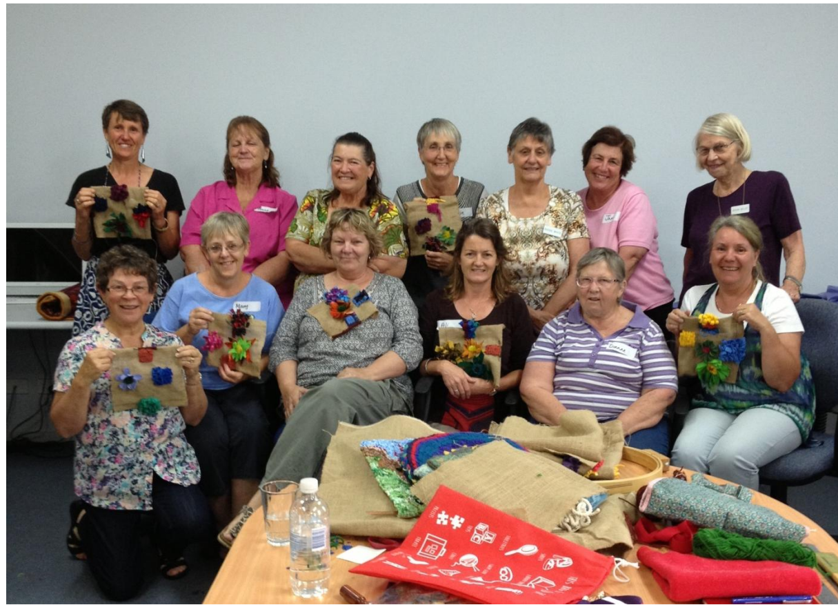
HOLBROOK PARTICIPANTS 23 rd March 2015