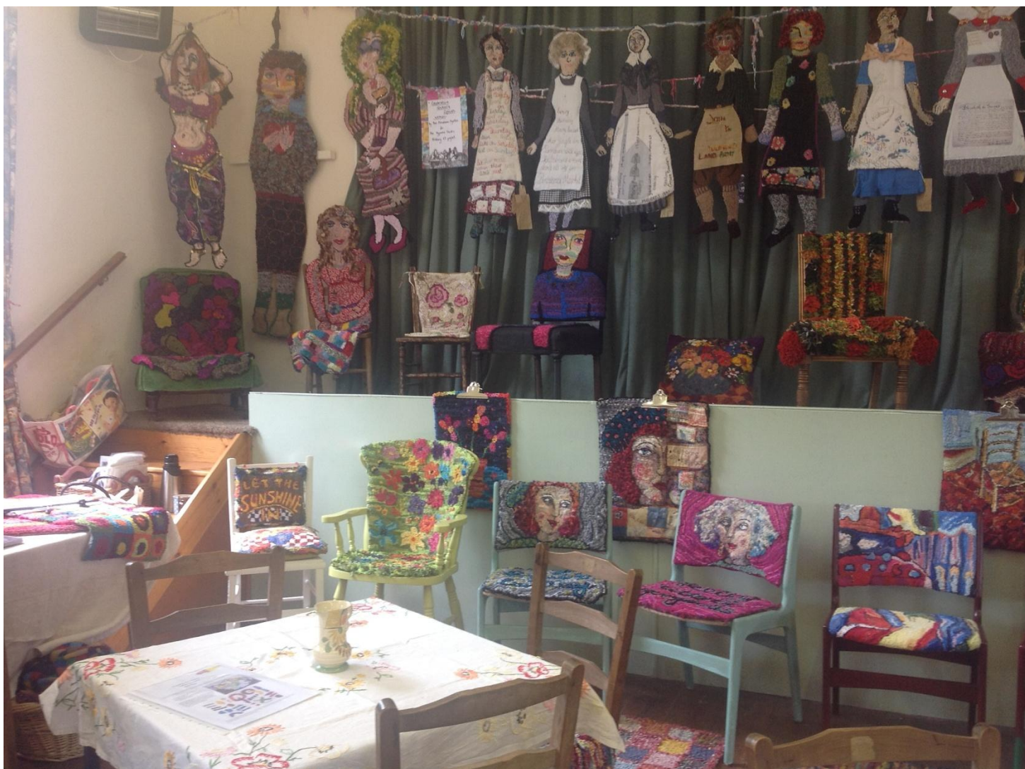
Photos of the work of the 'Happy Hookers group in Cornwall at their annual exhibition called 'We are not just doormats'