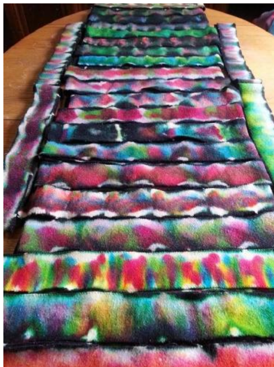
Blanket dyed ready for use.