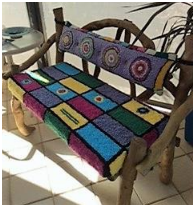
Marlene's rustic bench cover.