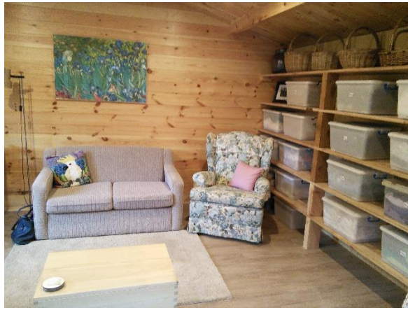
Inside the studio