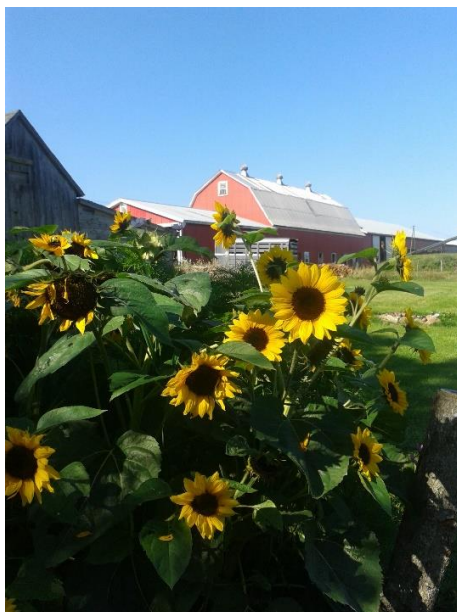
SUNFLOWERS ON A FARM IN Nova Scotia Canada.

“I understand sir, but you need to renew your passport first. It expired six weeks ago.”