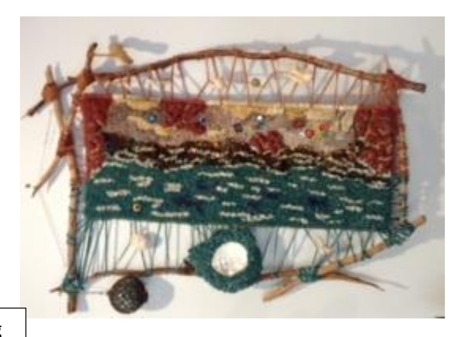
Judi Tompkins wall hanging pieces using stick framing. And a finely hooked piece using wool yarn

Another day we visited Judi Tompkins and just loved her new house. It was very pleasing from the large rooms and high ceilings to other more personal things like heated toilet seats. It would be a pleasure to live in such a well thought out house.