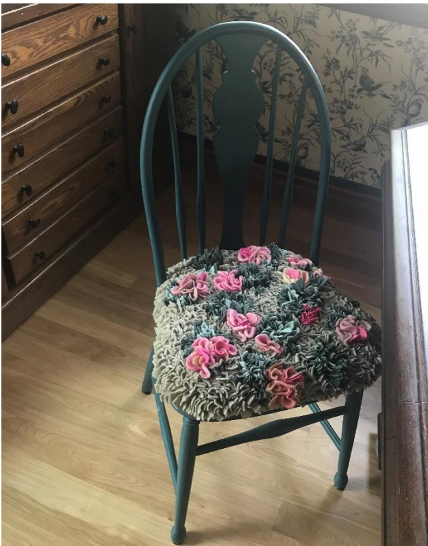
Progy chair pad.