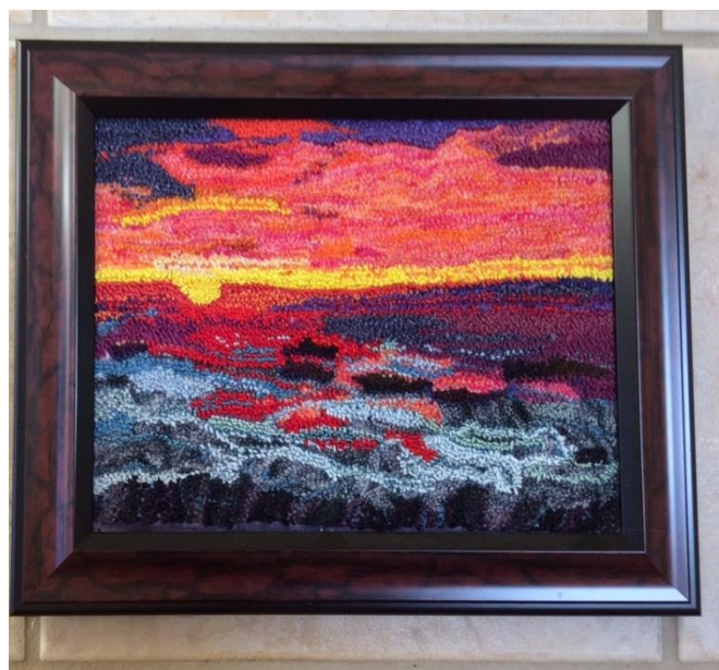
Lake Huron, South Hampton, Canada.

Over the past year, I met many interesting artists. We have had great teachers at the School and I referred to our attendees as a " Sisterhood Of Fibre Artists"