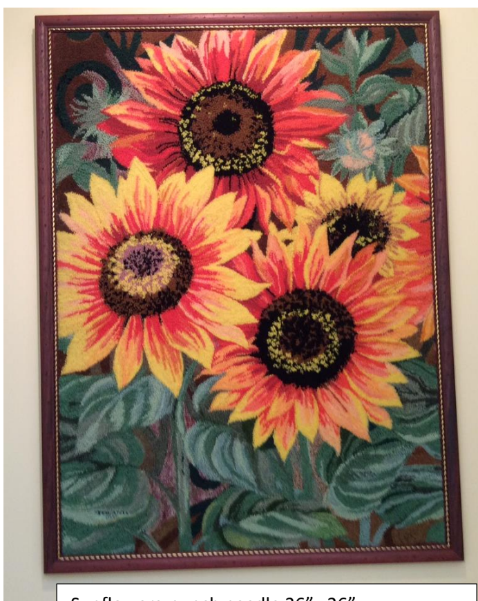
Sunflowers-punch needle 36" x26"