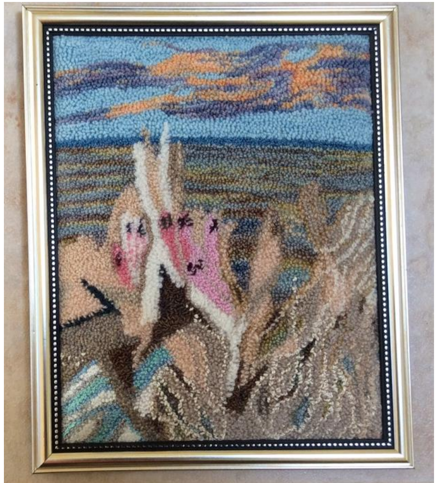
Pink ladies in ice.