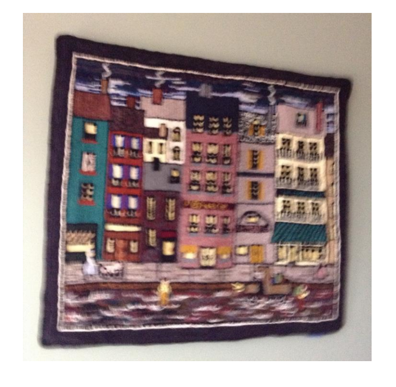
Continued next page