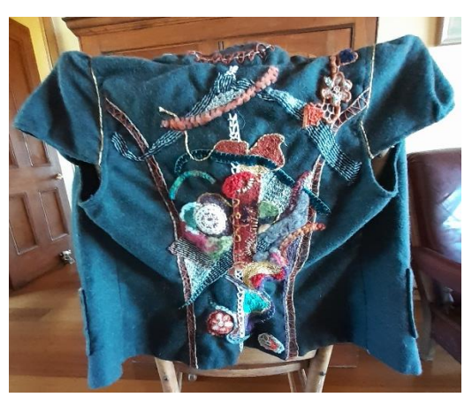
Back of top. And below front of the same top.