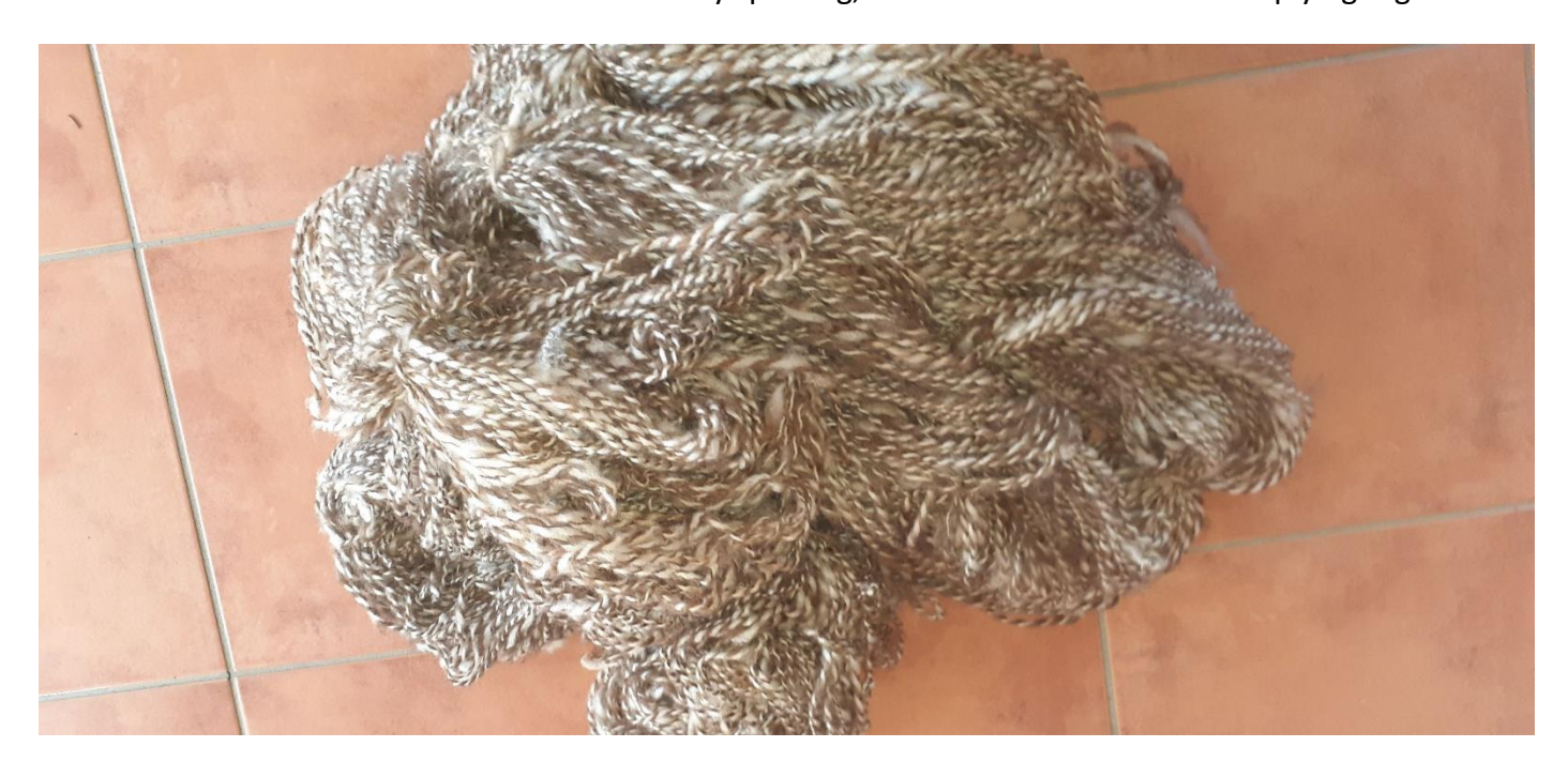
QUEENSLAND - Kingaroy- Judith Brook. Discombobulated