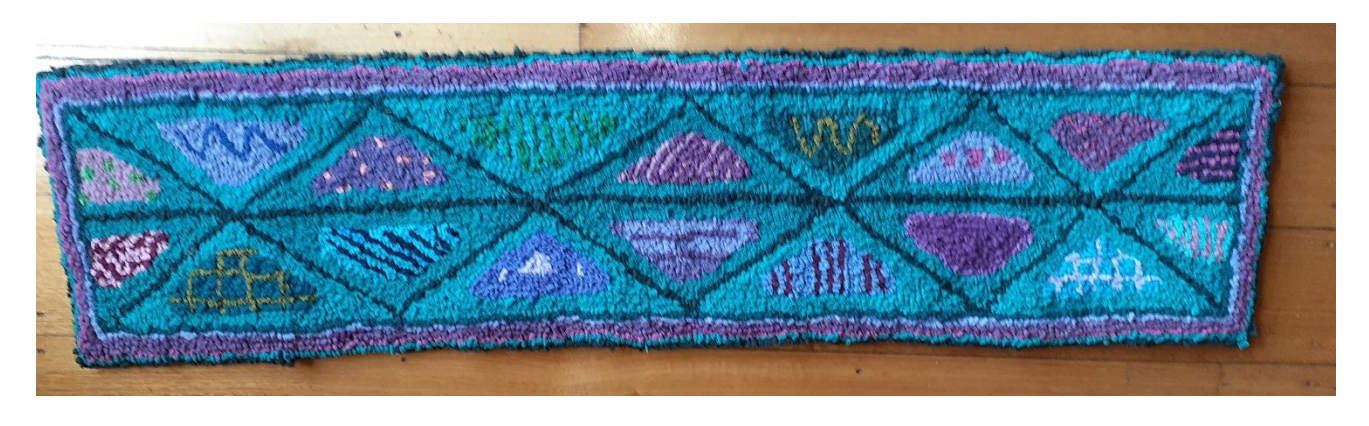
Table runner— (to use when putting hot dishes on a table.) Size 116cm x 28 cm or 45 1/2 in x 11in

NEW SOUTH WALES – Narrawilly Proggy Ruggers – Miriam