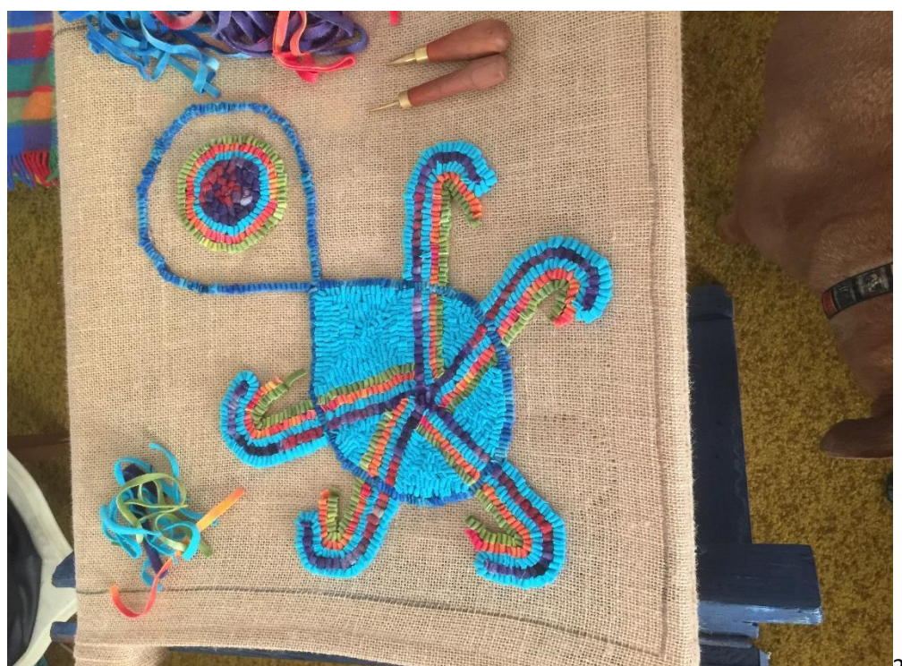
dining chair covers. First two alike. Pattern in progress. Kay