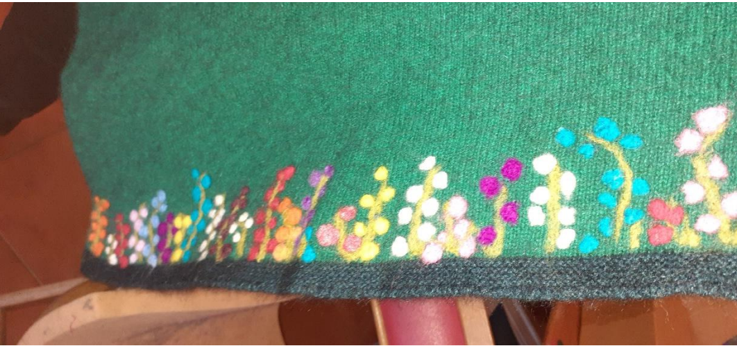
Needle felting on edge of poncho.