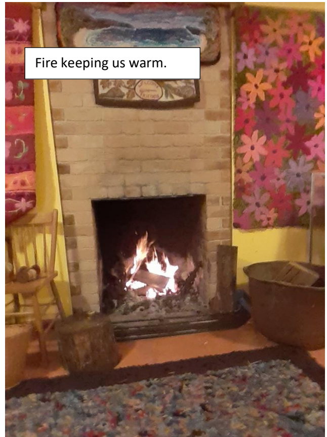
Fire keeping us warm.