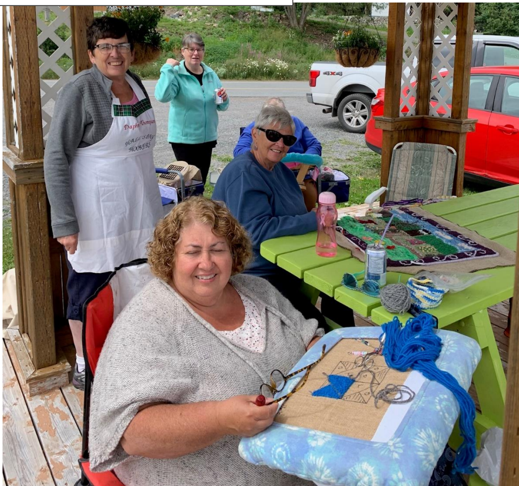
Members of Halls Bay Hookers on a road trip to Beaumont, Long Island, summer of 2022.