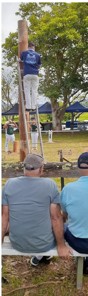
Left preparing for wood chop up high.