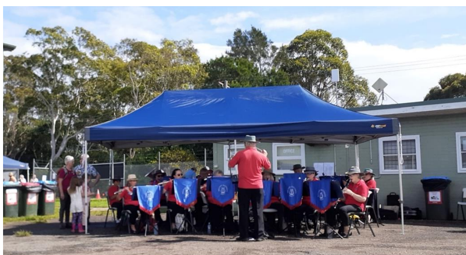
Above Milton Town band played for an hour on Saturday and to the left one of the junior horse riders with ribbons.