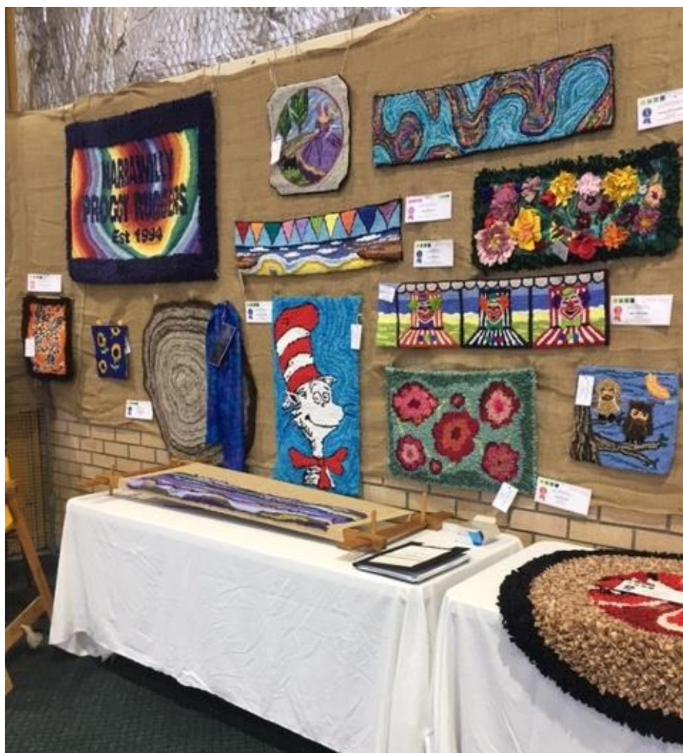
Some of the Narrawilly Proggy Ruggers Entries and display.