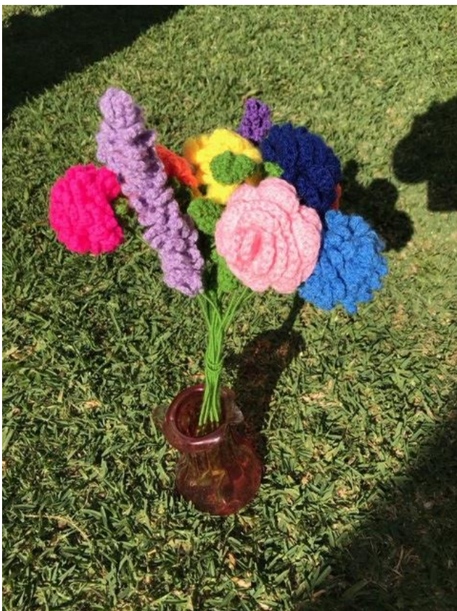
These flowers were crocheted by my 13 yr. grandniece for me. Annette

My niece from Germany with husband and four kids have arrived on Sunday, and already the older girls are keen on rug hooking. I set them up with an embroidery frame to try it out. Annette is 13 and very "hooked". Annette