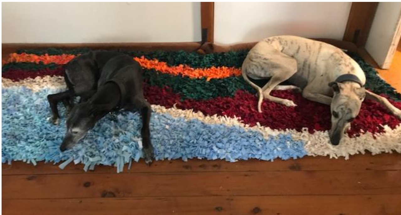
Dogs love the rug. Alana

I call it 'Colours of the West' I vaguely copied it from an aerial photo of some Western Australian coastline. My goal is to make a rug to represent all the different places my various children live. It is 80cm x 220cm, and it weighs a ton. Alana