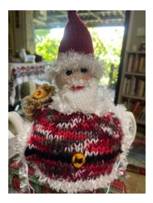
and a Santa Claus tea cosy.

It's not my age that bothers me - it's the side effects